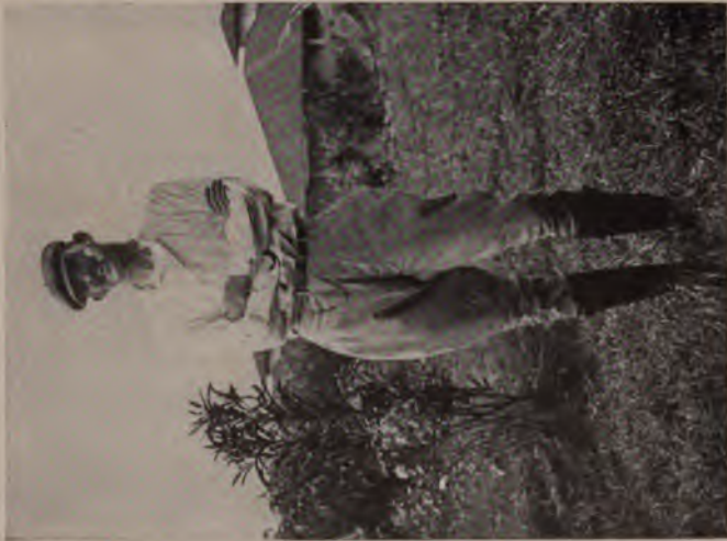
"Why, the fact is," said Corporal Macey